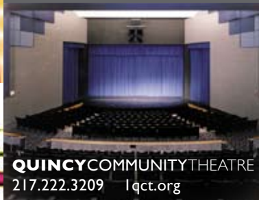
QUINCY COMMUNITY THEATRE 217.222.3209 | qct.org